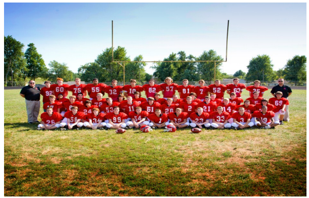
7th& 8th Grade Football 2012